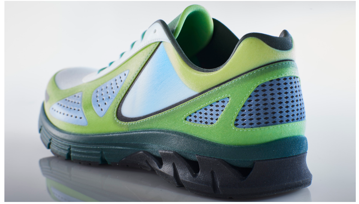
Figure 1. This full-color multi-material athletic shoe was 3D printed in one piece and represents a range of Shore A values.

photopolymers are also REACH-compliant and environmentally safe.