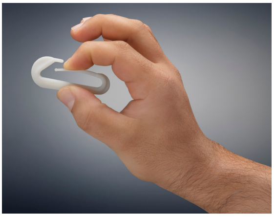
Figure 3. Rigur material was engineered for prototyping polypropylene products.

Durus is the original Stratasys offering for prototyping semi-rigid polypropylene products that can withstand contact forces and give when pulled. Durus is a milky white color.