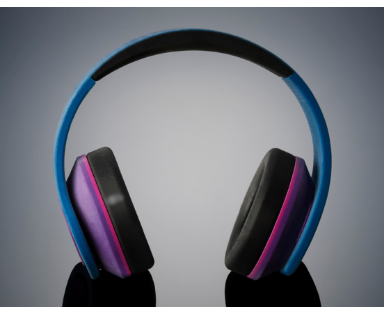
Figure 4. The rubber pads on these headphones have a soft Shore A value of 27. The full model was 3D printed in one piece.

This PolyJet material has been formulated for improved dimensional and visual characteristics as well as greater strength. Parts made from Rigur are bright white (Figure 3) and have better surface finishes than Durus. This makes Rigur great for visual applications, and its higher temperature resistance (three times that of Durus) and strength (twice that of Durus) make it a good choice for form, fit and light functional testing of parts that will be produced in polypropylene.