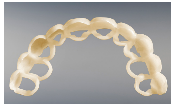
Figure 5. VeroGlaze produces functional dental veneer try-ins.

Property-wise, these materials are nearly identical to Rigid Opaque. The one exception is stiffness, which is nearly 50 percent greater, so these materials are strong and very rigid.