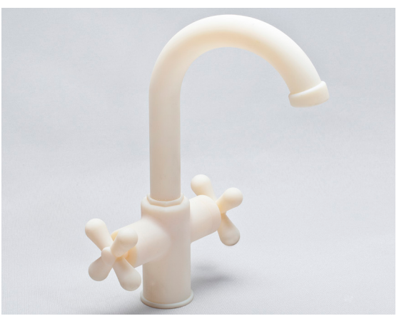
Figure 6. High Temperature material can withstand hot fluids.

As its name indicates, this material is for applications that have elevated temperatures. Straight from the 3D printer, High Temperature material has up to a 55°F higher heat deflection temperature (HDT) than any other PolyJet base resin. With an optional thermal post cure, HDT climbs to 80°C (176°F), which is close to that of an average ABS<sup>1</sup>.